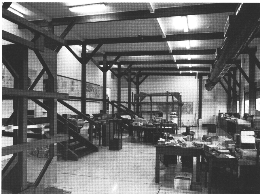
Figure 3. CSIRO North Ryde (Sydney) laboratory, showing Helmholtz coil sets for the cryogenic magnetometer (background) and the furnace (foreground).

optimising efficiency and enabling up to 200 samples to be processed each week.