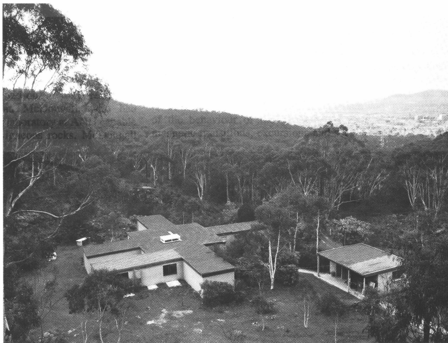
Figure 2. Black Mountain laboratory, Canberra. Its original cruciform shape has been altered by the addition of another wing in 1985.

Natural diversification led to several new avenues opening up in the 1970s such as archaeomagnetism and investigations of the behaviour of the geomagnetic field, palaeointensity, magnetic transitions, excursions and secular variation studies.