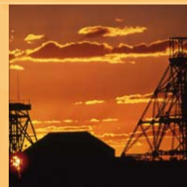
Gold mine Kalgoorlie WA

Gold/Uranium/Copper/Rare Earth Elements: Olympic Dam (SA)