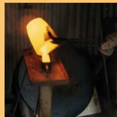
Gold pour WA