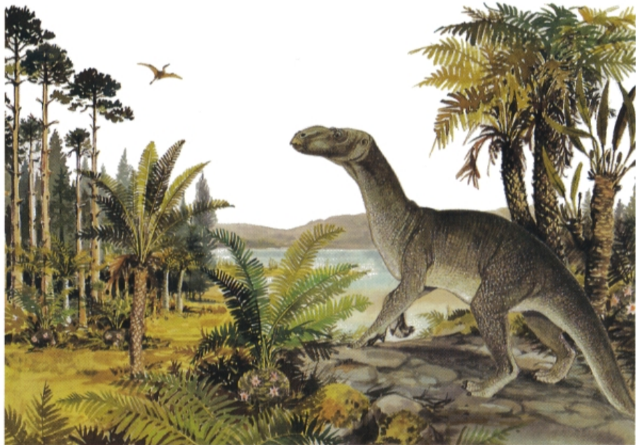
A reconstructed Australian landscape for Jurassic-Cretaceous times. A number of dinosaur species very similar to those found on other continents inhabited this environment. One unique to Australia was the very large Muttaborrasaurus, whose fossilised remains have been found at Muttaborra (Qld). The flora was dominated by conifers, cycads and tree ferns.