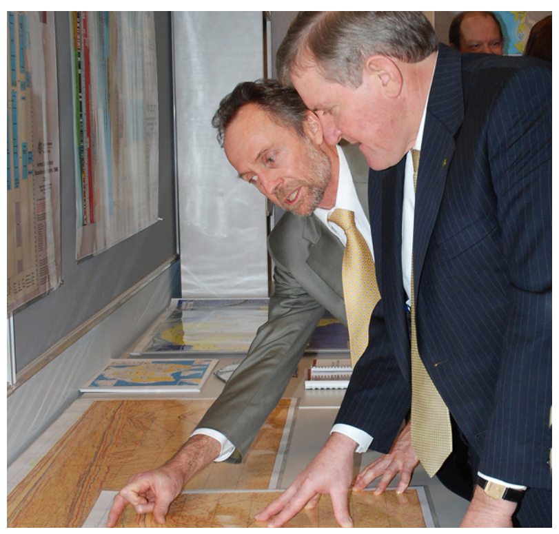
Figure 1. Minister for Industry, Tourism and Resources, the Hon. Ian Macfarlane, MP viewing some of the acreage release data now available in the new Data Room following the opening.

'The global oil exploration community is showing significantly increased interest in Australia following initiatives by Geoscience Australia to accelerate access to offshore petroleum exploration datasets', Mr Macfarlane said.