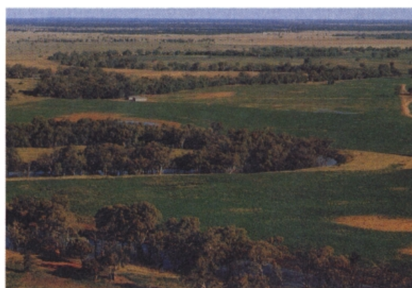
Figure 3. Irrigated lucerne on alluvial flats along the Macquarie River, central New South Wales.

Lucerne is a characteristic plant of irrigated river flats in central and northern New South Wales and the lower Murray in South Australia, as already mentioned. When grown as a pure stand almost all irrigated lucerne (nearly 100 000 ha in 1975–76) is cut for hay.