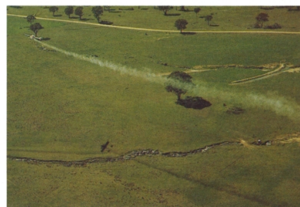
Figure 4. Aircraft top-dressing sown pasture with superphosphate in the Southern Tablelands of New South Wales. In 1979–80 aircraft spread 500 000 tonnes of superphosphate, top-dressing and seeding 4.4 million hectares.

In general, Australian native pastures show a poor response to fertilisers so that most of the 9 million hectares of pastures fertilised in 1975–76 were sown pastures—see the map overleaf. (The statistics used for the map exclude the use of lime, gypsum and dolomite, which are soil conditioners rather than fertilisers.) This area was half that fertilised two years previously, due largely to low market returns on livestock products and the temporary removal of a government bounty on superphosphate, which makes up 90% of all fertilisers used on pastures (1.08 million out of 1.19 million tonnes in 1975–76). However, fertiliser use on pastures is again increasing and in 1979–80 2 million tonnes was spread on nearly 15 million hectares.