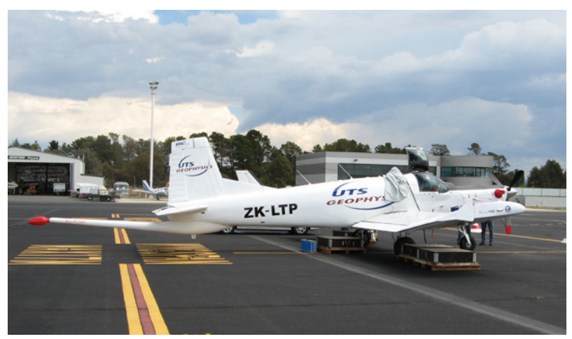
Figure 2. UTS' highly modified Fletcher aircraft, purpose-built for the slow, low level survey flying required by AWAGS 2.

With completion of the survey the contractor will process the acquired data and expects to supply the final processed data to Geoscience Australia by March 2008. The processed radiometric data from AWAGS 2 will form the Australian radioelement datum and be used to adjust data in the national radiometric database (all Commonwealth and state public-domain data) to the standard. The survey will also be the datum for airborne radiometric data acquired in the future.