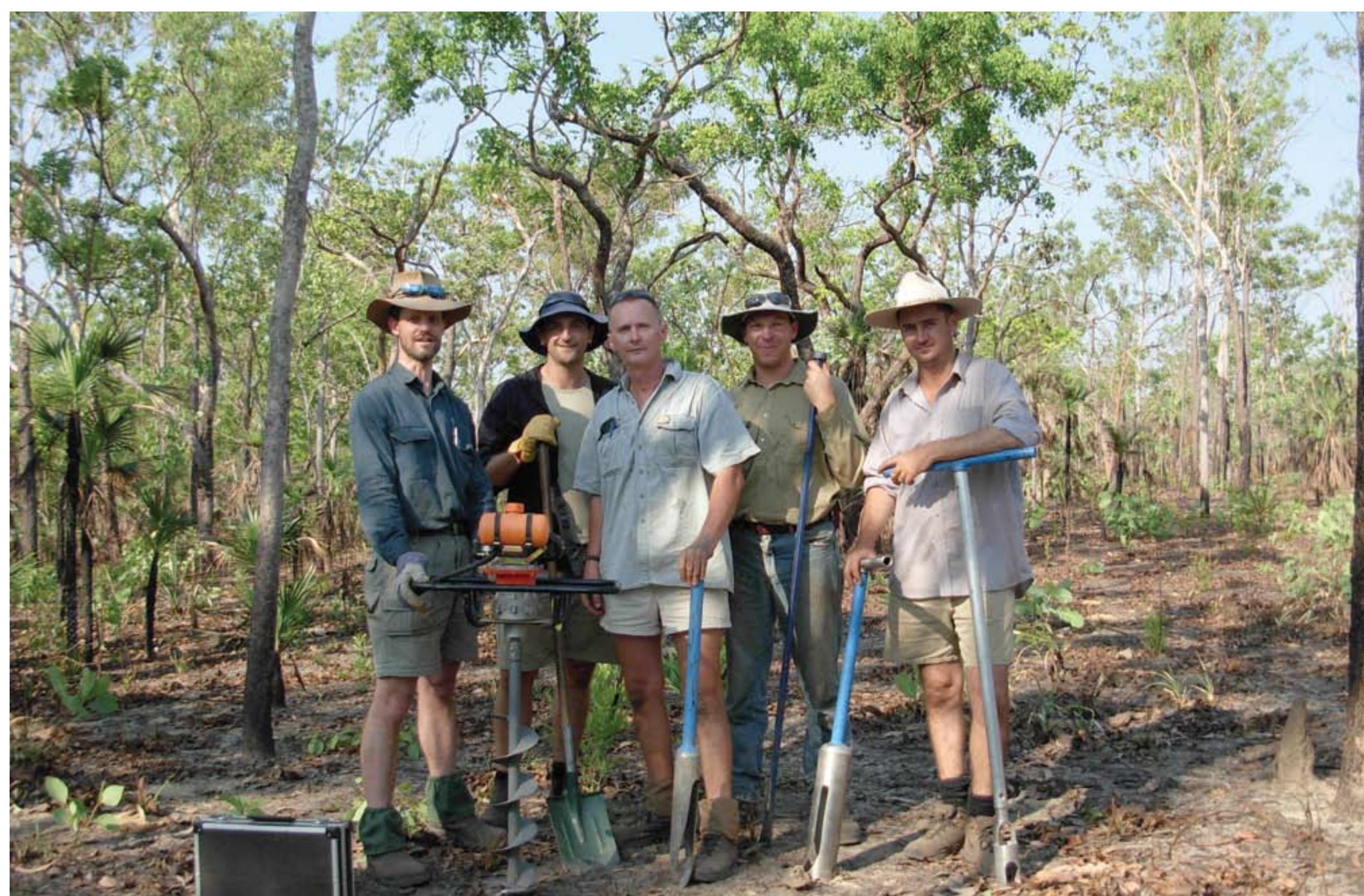
Figure 2. One of the field teams finishing a successful sampling trip.

At each site, sampling teams (Figure 2) collect outlet sediment samples from the surface (0-10 cm) and from a deeper level (between ~60 and 80 cm) using centrally provided equipment (Figure 3) and following a detailed set of instructions. Field data, e.g. GPS coordinates, soil colour and pH, are measured (Figure 4) and recorded digitally.