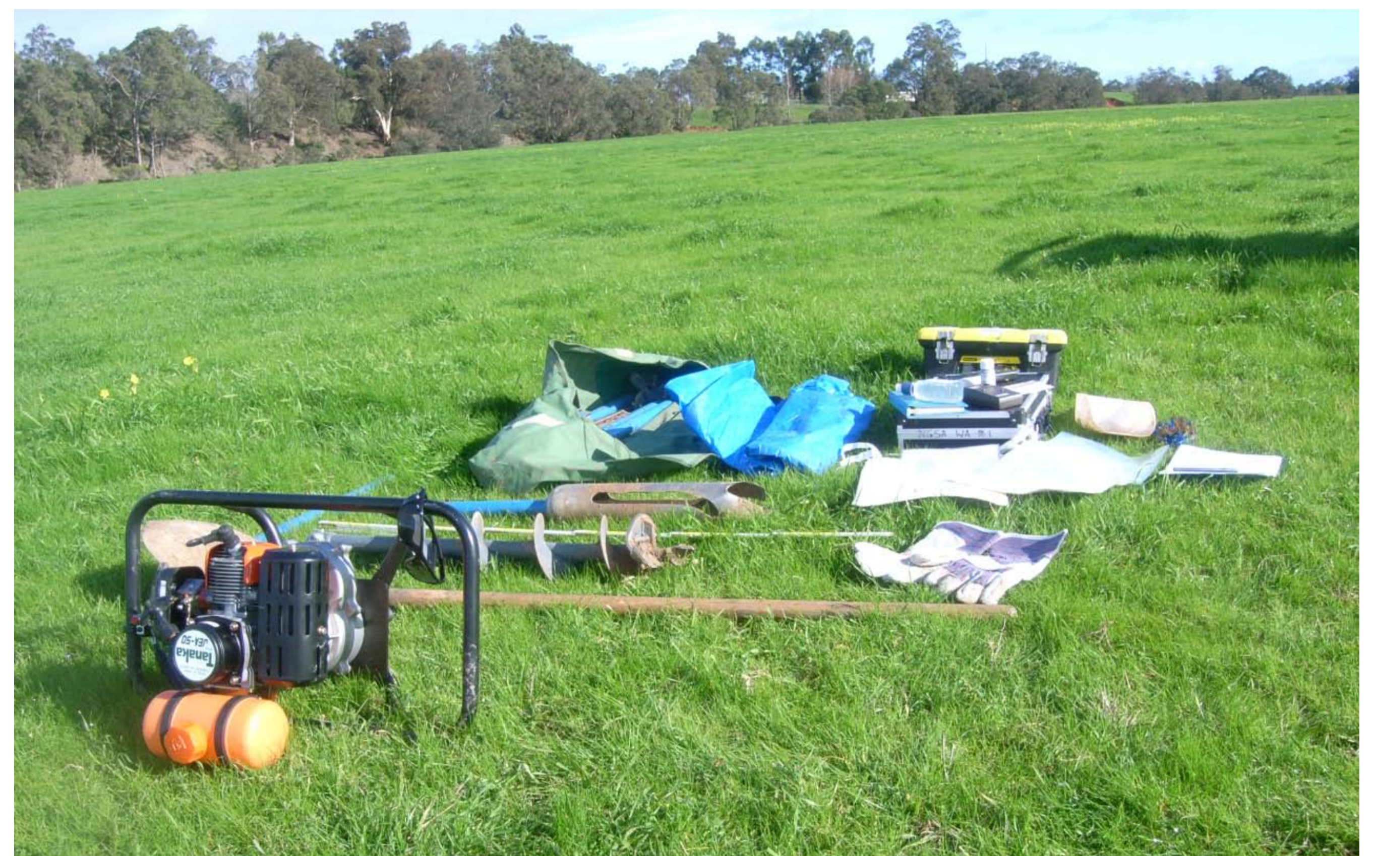
Figure 3. Sampling equipment and consumables provided to all field teams.