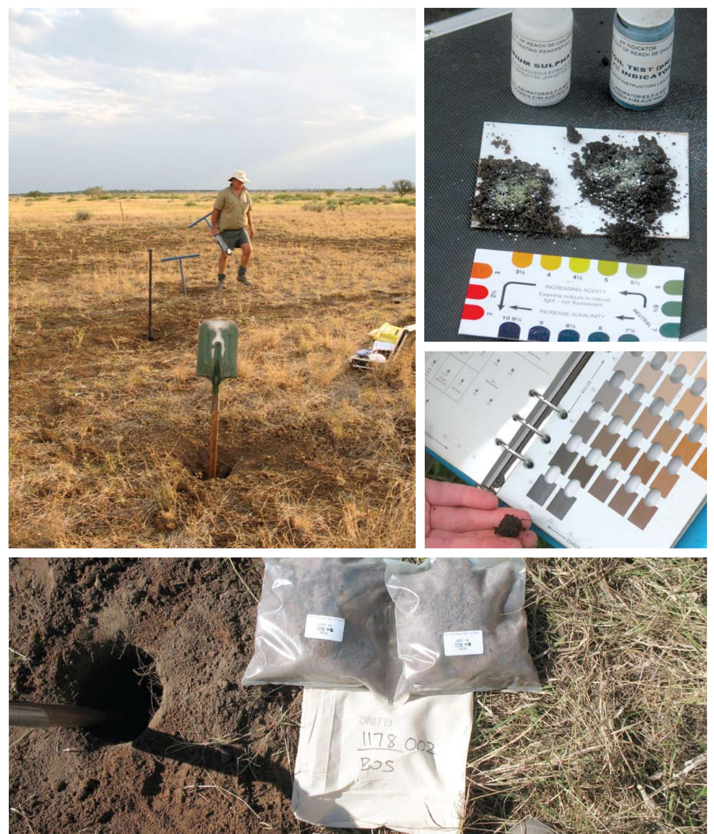
Figure 4. Auger holes, field pH, soil colour and sample bags.

In the laboratory, the collected samples are dried, split and sieved before being submitted to analysis for more than 60 elements/parameters.