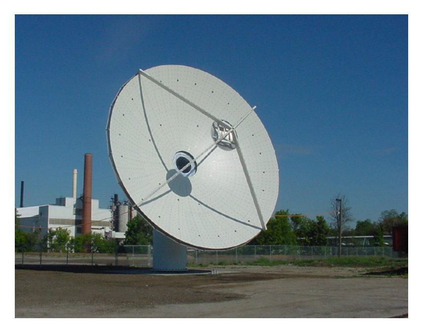
Figure 2. AuScope Patriot 12 metre VLBI telescope dish to be installed at Katherine, Northern Territory and Mingenew, Western Australia.

By collecting geodetic data from GNSS Continually Operating Reference Stations (CORS), Geoscience Australia is able to measure the relative locations of points up to several thousand kilometres apart with an accuracy to several millimetres. As such, the Australian Regional GNSS Network (ARGN) operated by Geoscience Australia is the national foundation for all positioning applications in Australia. However this network is sparse and tells us little about intraplate deformation and the resultant neo-tectonic stresses. In addition, it does not provide good proximity for the many surveying applications that use the ARGN data.