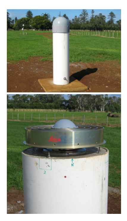
Figure 1. Typical AuScope GNSS installation at Norfolk Island collocated with Australian Tsunami Warning Service (ATWS) seismograph station.

The refinement of the global geodetic frame of reference requires a multi-technique approach. Broadly speaking SLR provides the definition of the origin of the frame (that is, the geocentre). VLBI provides the orientation of the frame within the celestial reference system and the scale of the terrestrial frame. GNSS provides the density of stations within the frame to allow effective monitoring of the global tectonic processes as