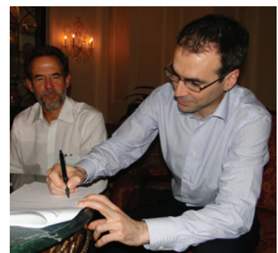
Figure 1. Signing of the collaborative agreement between Geoscience Australia and the Global Earthquake Model by GEM Secretary General, Rui Pinho, with John Schneider of Geoscience Australia in the background. The signing was held on 3 June 2010 in Washington, USA.

www.ga.gov.au/minerals/research/national/oegf/index.jsp