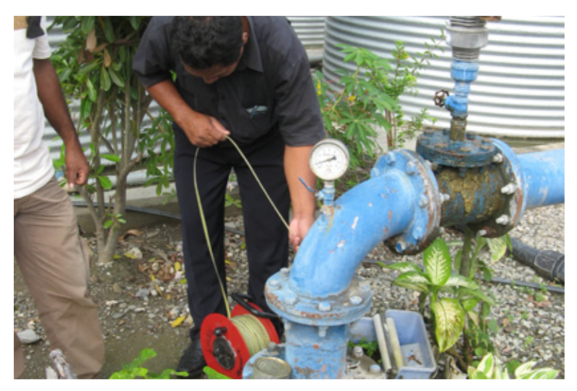
Figure 3. Groundwater monitoring during fieldwork in selected sites.