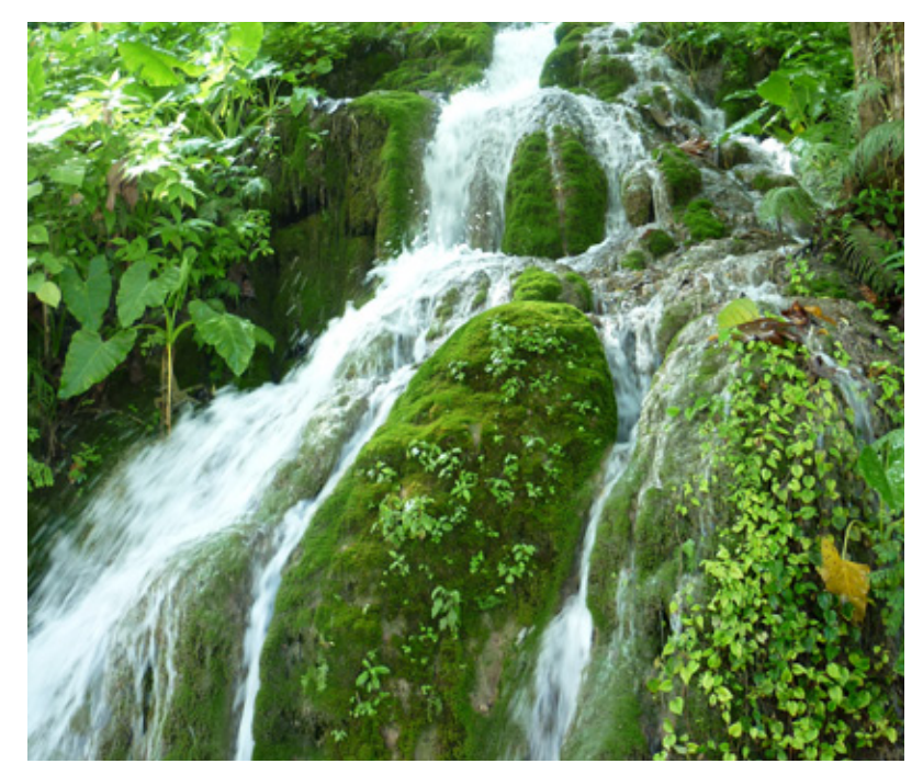
Figure 1. The project provided fundamental datasets and maps to assess the potential impacts of reduced groundwater recharge and availability on people and their livelihoods.

In June 2010, Geoscience Australia, in partnership with the Government of Timor-Leste's National Directorate for Water Resource Management (DNGRA) and the Rural Water Supply and Sanitation Program (BESIK) began a two-year project, the Assessment