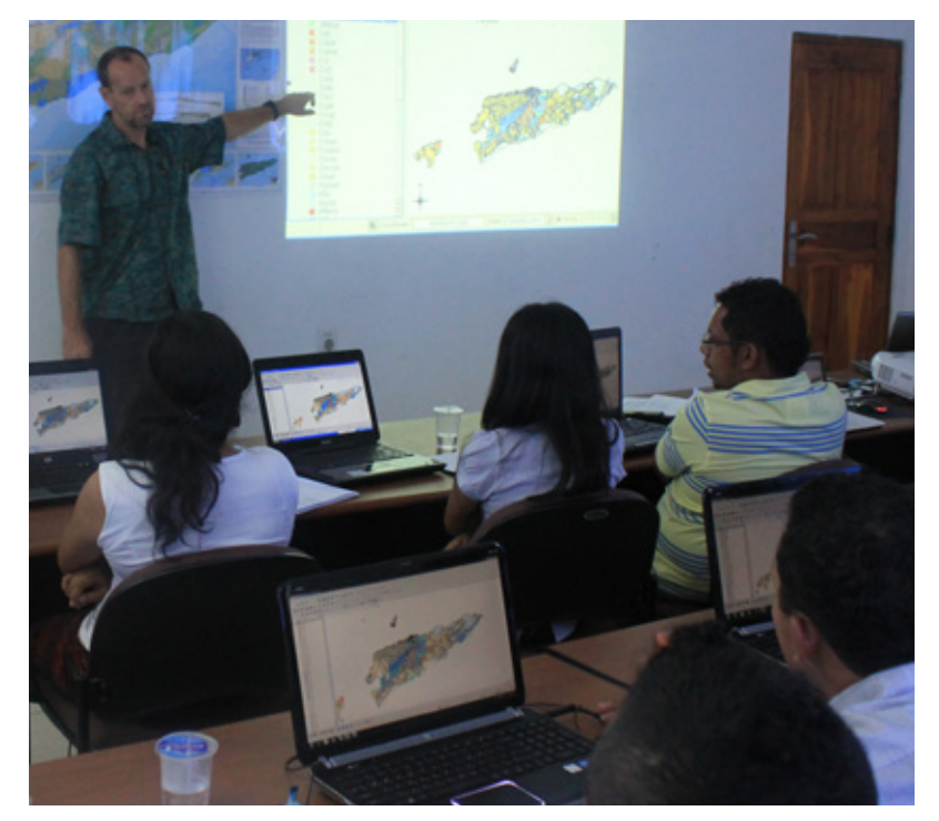
Figure 4. Training in GIS mapping for staff from the DNGRA and other Timor-Leste government agencies. Attendees were instructed in GIS mapping and used these skills to reproduce the National Hydrogeology Map.

Three workshops were also conducted in Dili during the project. The main purpose of the workshops was to engage with the Government Directorates of Timor-Leste, including the DGNRA, to ensure that their suggestions were implemented effectively throughout the project. Attendees from Timor-Leste included representatives from DNGRA, BESIK, Agriculture and Land-use Geographic Information System (ALGIS), National Directorate for Water Supply and Sanitation (DNSAS), Seeds of Life and Timor-Leste directorates for geology and the environment. Australian representatives from AusAID (Australia's agency for international development), the Department of Climate Change and Energy Efficiency, Geoscience Australia and CDU also attended. The outputs of the project were presented and received by the Australian Ambassador, Miles Armitage, and the Secretary of State for Electricity, Water and Urbanisation, Timor-Leste, Senor Januario da Costa Pereira, respectively.