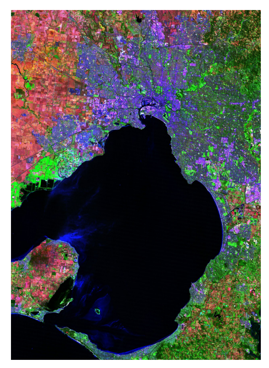
Figure 2. Melbourne in 'false colour'. Satellites generally observe in slightly different wavelengths of light to those that we see. Satellite images are therefore false-colour, but can enhance features like urbanization (mauve-purple in this image), irrigated areas and wet forests (green here), and dry grasslands (red-brown here).