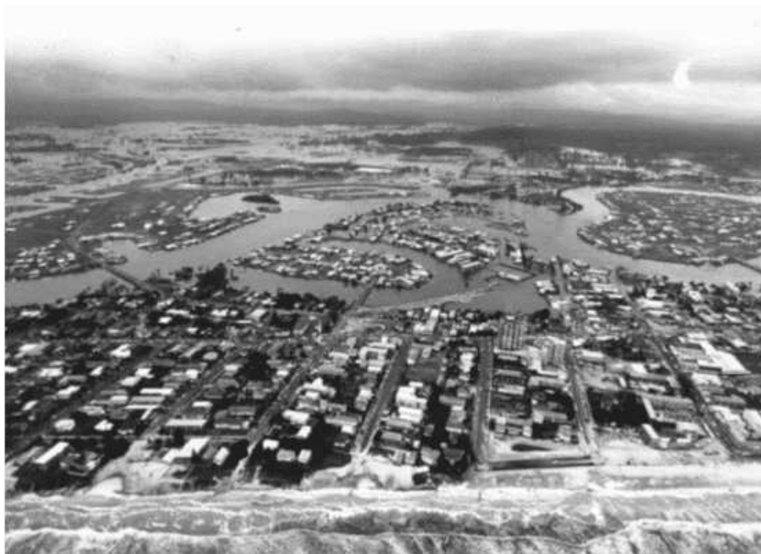
Plate 9.35: Gold Coast, June 1967 – Looking west of Surfers Paradise towards the flooding in the Bundall and Benowa area