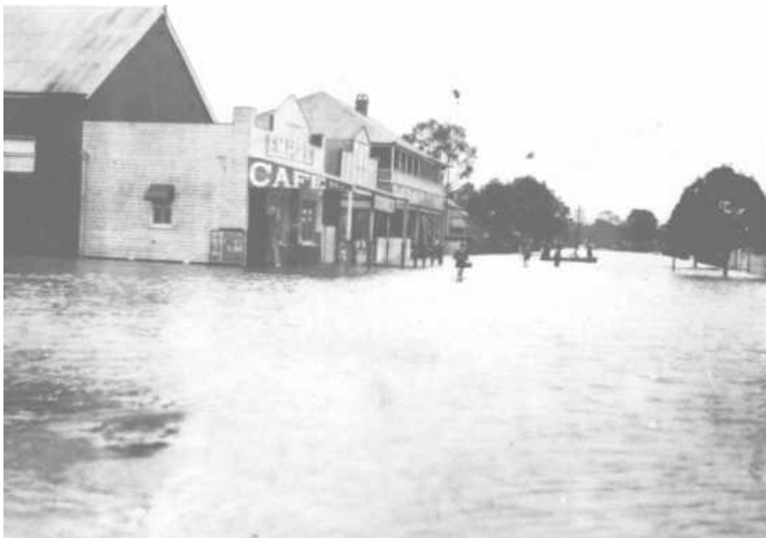
Plate 9.4: Caboolture, 5 February 1931 - Matthew Terrace (opposite the railway station) looking north from King St after the peak of the flood