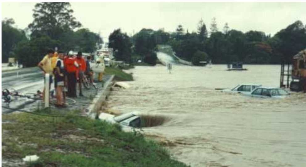
Plate 9.7: Pine Rivers, 12 December 1991 - Cars engulfed by flooding of the South Pine River over the Bald Hills Flats, Gympie Road, Strathpine