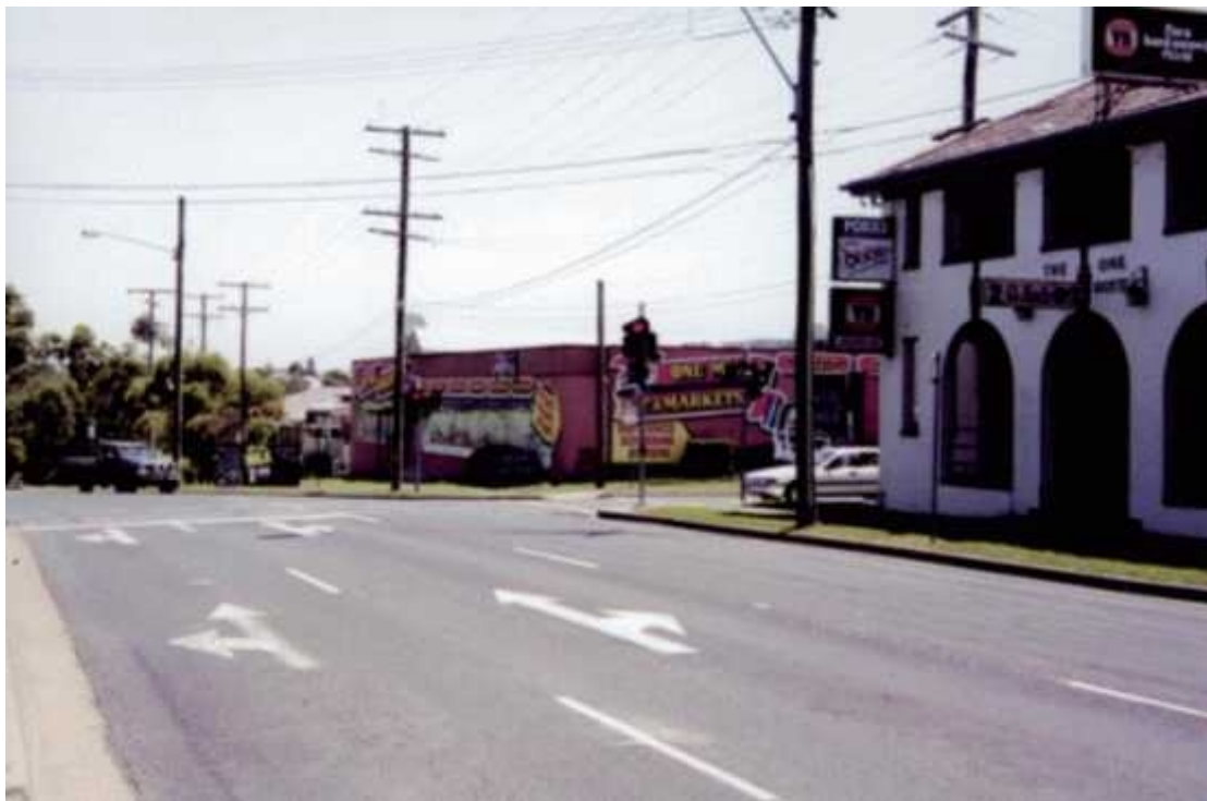
Plates 9.29-30: Ipswich - One Mile Hotel looking towards Leichhardt. Top: January 1974 – Flood. Bottom: November 2000 – No flood