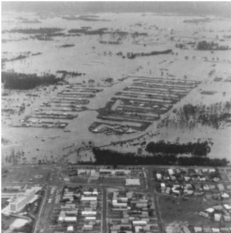
Plate 9.34: Gold Coast, January 1974 – Floods in the Miami Keys area back to Bermuda St. T.E. Peter Drive is covered in water