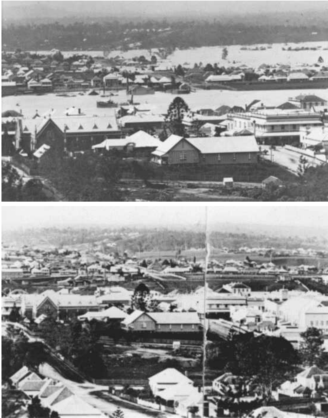
Plates 9.10-11: Ipswich – View north from top of Ellenborough St., Ipswich - 1893. Top: Flood, February. Bottom: No flood, about May