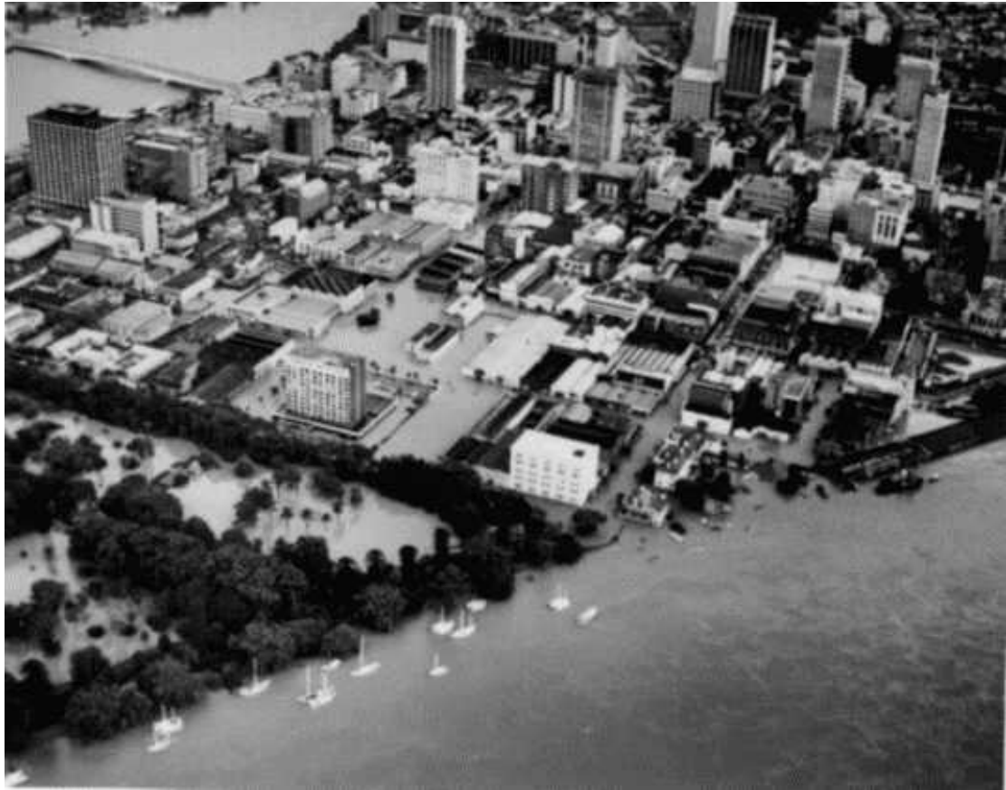
Plate 9.31: Brisbane, 28 January 1974 – Aerial view of Brisbane City showing the extent of flooding in the Brisbane Botanical Gardens (bottom left) up to Elizabeth St