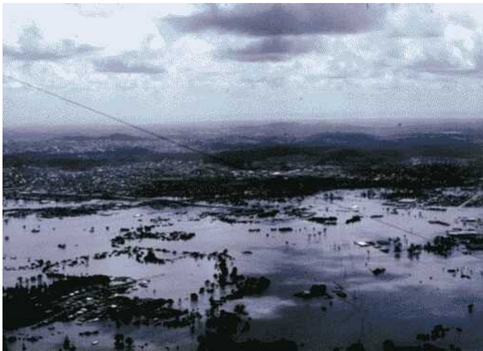
Plate 9.16: Brisbane, January 1974 – Flood – Oxley Creek, looking north, Corinda