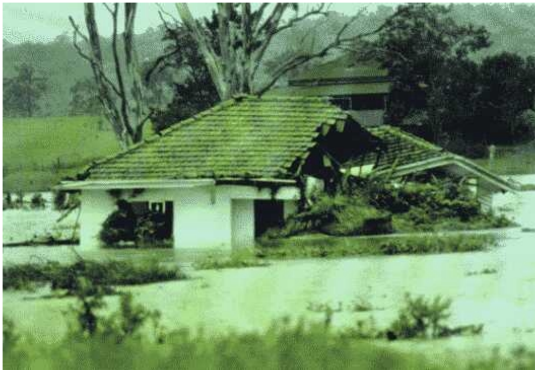
Plate 9.32: Logan, January 1974 – Flood - One of the houses lost during the 1974 flood in Tygum Lagoon area, Waterford West. The site is now a Council park