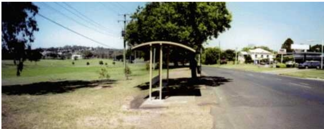
Plates 9.27-28: Ipswich - Old Toowoomba Road near One Mile Shopping Centre, Leichhardt, looking towards town. Top: 27 January 1974 – Flood, 9 am. Bottom: November 2000 – No flood