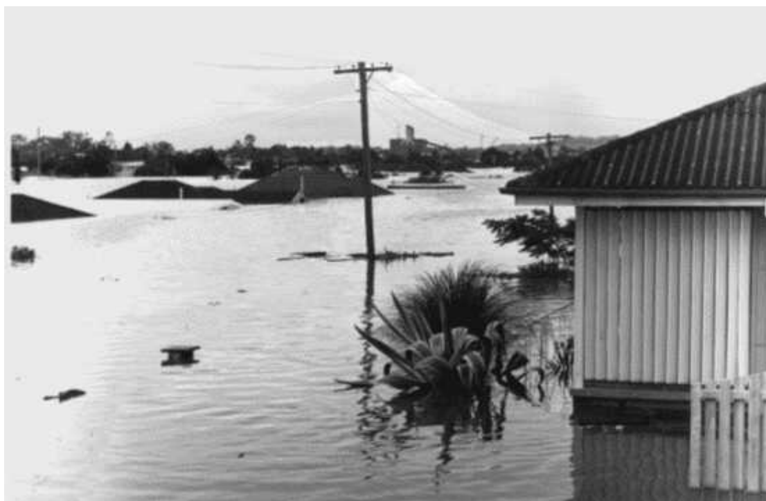
Plate 9.17: Brisbane, January 1974 – Central Avenue, Sherwood. Looking east towards Oxley Creek and the Tennyson Powerhouse