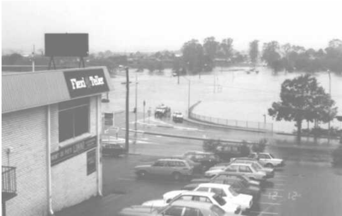
Plate 9.3: Caboolture, 11 December 1991 – View south of flooding from Centre Point Plaza car park in Elliot St.