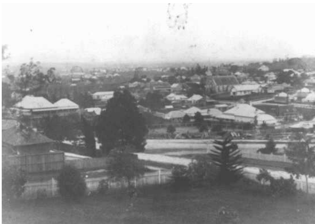
Plates 9.13-14: Ipswich – View from the Ipswich general hospital towards Churchill St and the St Stephens Presbyterian Church. February 1893. Top: Flood. Bottom: No flood