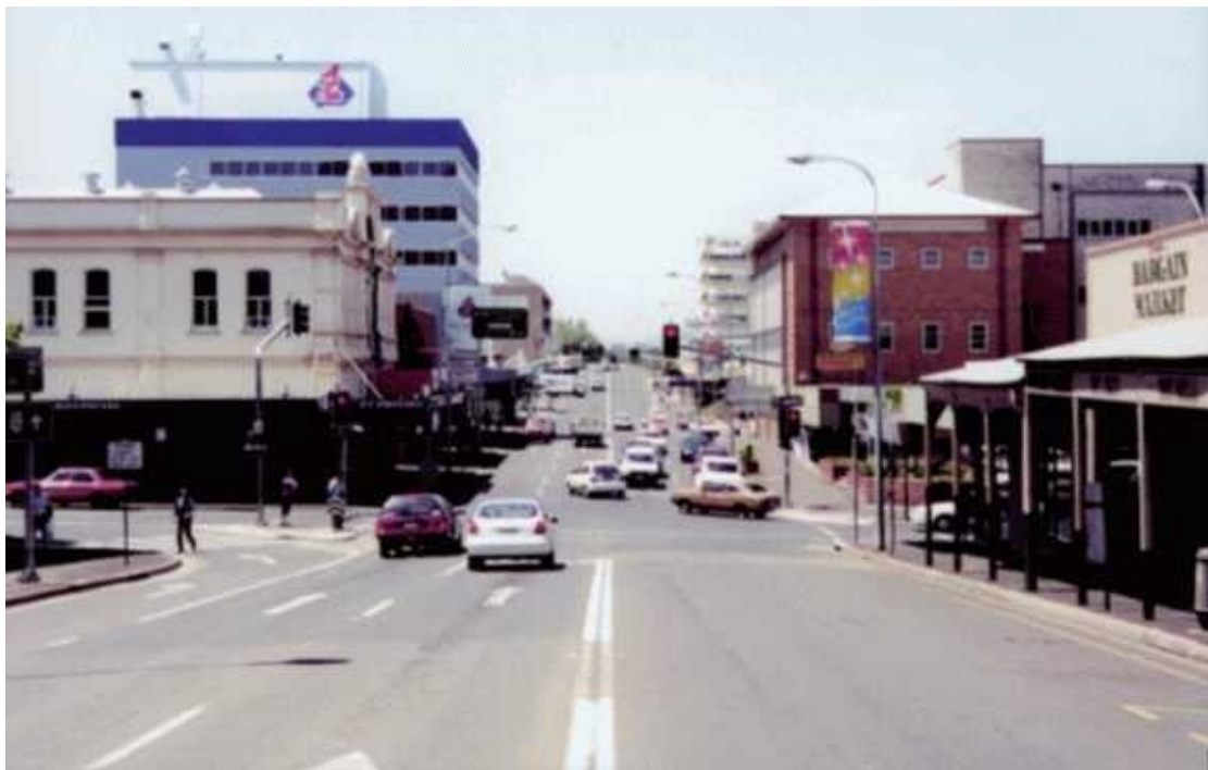
Plates 9.18-19: Ipswich - Looking down East St to the north, near intersection with Limestone St, towards David Trumpy Bridge. Top: 28 January 1974 – Flood. Bottom: November 2000 – No flood