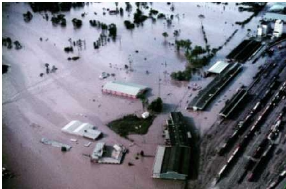
Plate 9.26: Brisbane, January 1974 – Flood – Railway shunting yards at Tennyson near Ipswich road