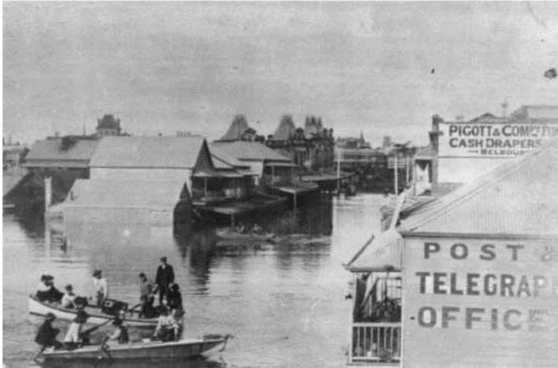
Plate 9.1: Brisbane, February 1893 – Flooding in Melbourne St, South Brisbane