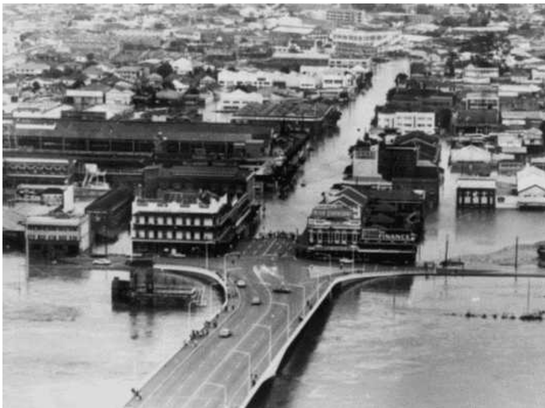
Plate 9.2: Brisbane, January 1974 – Aerial view of South Brisbane showing the southern end of the Victoria Bridge leading into Melbourne St.