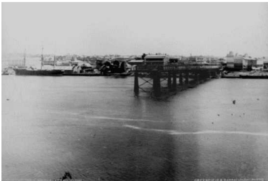
Plate 9.9: Brisbane, February 1893 – Looking towards South Brisbane after the 1893 flood at the Victoria Bridge, damaged in the flooding