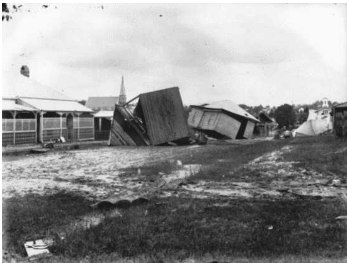
Plate 9.12: Ipswich, February 1893 – Flood damage, Wharf St, looking south (Courtesy of Hughes collection, Ipswich Historical Society. Plate: B. Taylor, courtesy A. Geertsma).