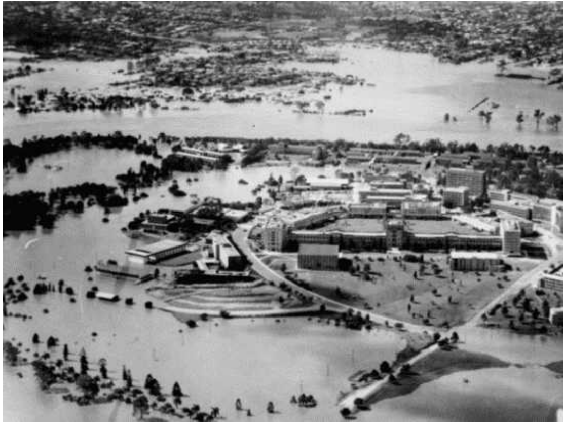
Plate 9.23: Brisbane, 29 January 1974 – Flooding of the Brisbane River on both sides of the University of Queensland, St Lucia. On the opposite bank behind the university are the inundated riverside suburbs of Fairfield (left) and Yeronga (right). Taken at 10 am