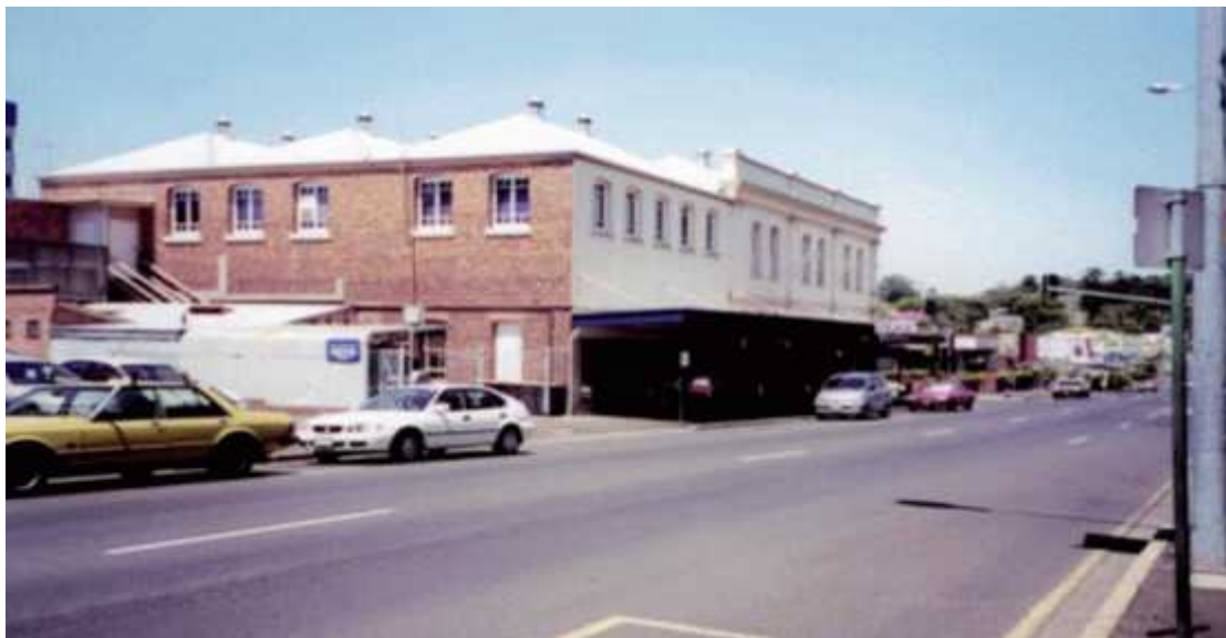
Plates 9.24-25: Ipswich - Limestone St, looking back to the intersection with East St. Top: January 1974 – Flood. Bottom: November 2000 – No flood