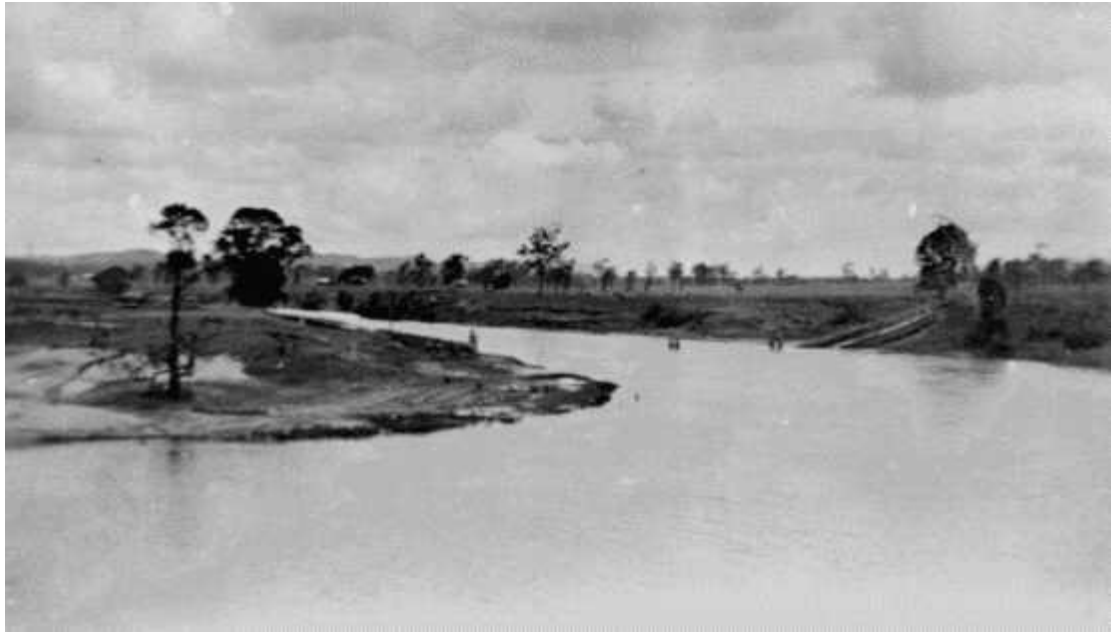
Plate 9.33: Logan, January 1947 – Flood – Logan City. Remains of Waterford Bridge