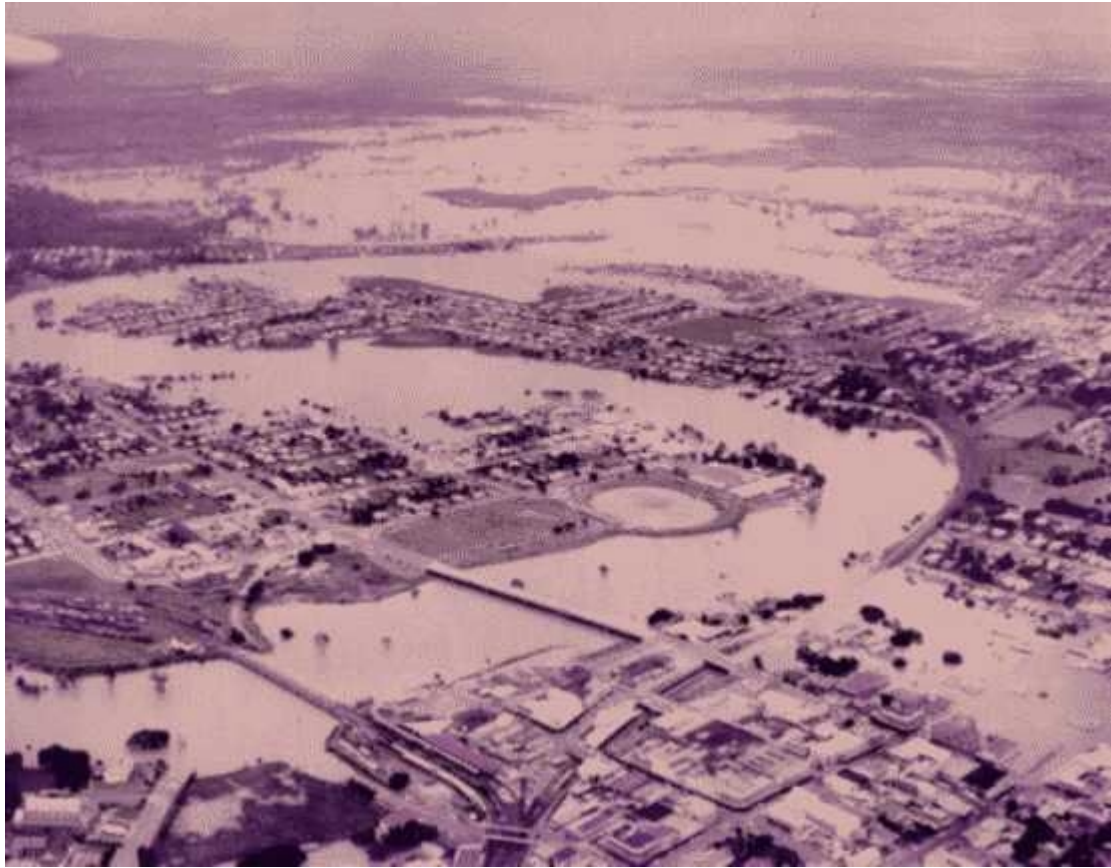
Plate 9.15: Ipswich January 1974 – Flood - Aerial view taken after the height of the flood