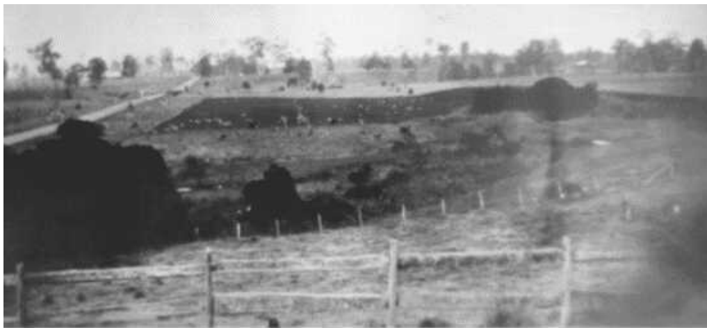
Plate 9.5-6: Caboolture – 1931 - View south from the present Elliot St over the present Centenary Lakes/Caboolture Sports Centre area. Morayfield road on left. Top: Flood, January. Bottom: No flood, 5 February, 1 pm