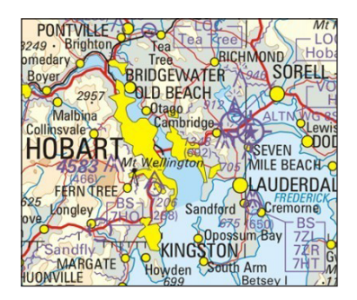
Figure 1. [Extract of 1:1 million scale World Aeronautical Chart for Hobart, Tasmania]

Airservices Australia and Geoscience Australia have a long history of working together to produce various scale flight navigation charts like the WACs, 1:500 000 scale Visual Navigation Charts (VNC) and 1:250 000 scale Visual Terminal Charts (VTC).