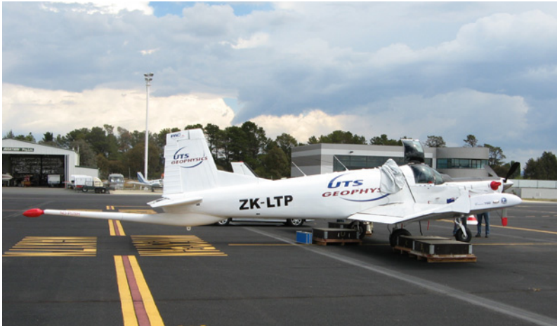
Figure 2. UTS' highly modified Fletcher aircraft, purpose-built for the slow, low level survey flying required by AWAGS 2.

With completion of the survey the contractor will process the acquired data and expects to supply the final processed data to Geoscience Australia by March 2008. The processed radiometric data from AWAGS 2 will form the Australian radioelement datum and be used to adjust data in the national radiometric database (all Commonwealth and state public-domain data) to the standard. The survey will also be the datum for airborne radiometric data acquired in the future.