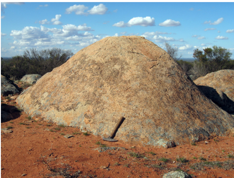
Figure 2. Outcrop of Mesoarchean granite.

The newly identified Mesoarchean rock is a grey, gneissic granite, trending north-south between Iron Knob and Iron Baron (figures 1 & 2). The rock was originally mapped as part of the Lincoln Complex, a term for local Paleoproterozoic intrusives, but the new age data indicate that this rock is approximately twice as old as first thought, and forms basement to the iron-rich sediments of the Middleback Ranges which have been mined for iron ore since the late 1800s.