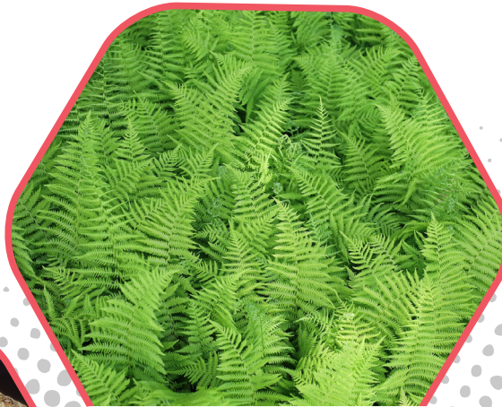
A dense carpet of ferns.

Ferns live in a wide variety of habitats but tend to live in places where environmental factors limit the growth of angiosperms (flowering plants). Often ferns will be found in the undergrowth of damp shady forests, in swamps, or growing on trees, especially in tropical and sub-tropical rainforests.