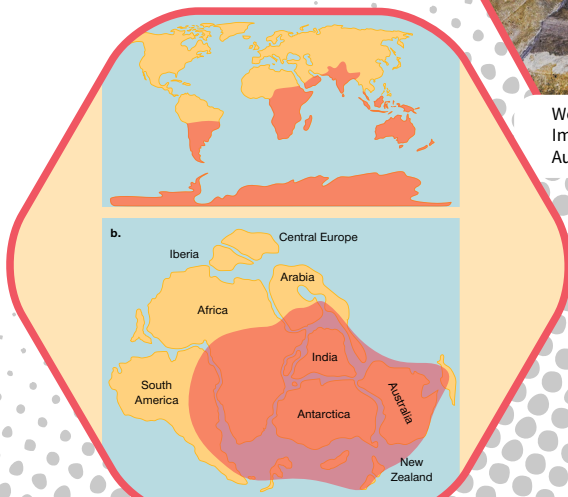
Modern distribution of fossil Glossopteris dated to the late Permian. b. Interpreted distribution of late Permian Glossopteris.