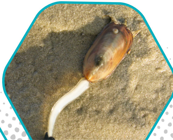
Modern brachiopod, Lingula anatina .

Today, brachiopods live in the ocean from the tropics to the poles and tend to be restricted to deeper water.