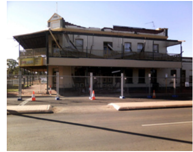
Figure 2. Damage caused to a hotel in Boulder. The damage is typical for two storey unreinforced masonry buildings with toppling of parapets either outwards into the street or inwards through the roof. This building also sustained other types of damage such as cracking over doors and windows and substantial cracking to internal masonry walls.

within Kalgoorlie between 28 April and 1 May. The team used a vehicle-mounted camera array developed by Geoscience Australia known as the Rapid Inventory Collection System (RICS). In total 230 000 geo-referenced high resolution images were captured within the urban area. This work was complemented by a detailed field survey which was conducted on foot between 18 and 22 May. Survey information was recorded using hand-held mini-computers which allowed the team of nine engineers and geographic information system (GIS) specialists to capture data about the damage caused. The team included two earthquake engineering researchers from the University of Adelaide and the University of Melbourne respectively. Over 400 buildings in four age categories were surveyed and assessments were made of the felt intensity in those locations. The survey locations are also shown in Figure 1.