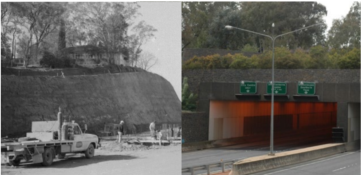
Figure 1: This pair of photos show the Molonglo Parkway (the west end of Parkes Way). The 1977 photo shows the cutting at ANU before it was covered to form the tunnel. At that time the then Bureau of Mineral Resources (now Geoscience Australia) carried out geotechnical studies for the alignment of the Molonglo Parkway from Acacia Inlet to Sullivans Creek.

The Geoscience Australia foyer display also acknowledges the role of Charles Scrivener, the New South Wales surveyor who was given the task of mapping a new federal territory.