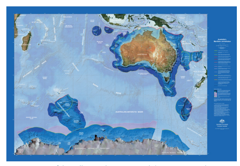
Figure 1. One of the wall maps showing Australia's maritime jurisdiction.

The maps detail the jurisdictional zones around the Australian mainland and those of Australia's remote offshore territories, including the Australian Antarctic Territory, Ashmore and Cartier Islands, Christmas Island, Cocos (Keeling) Islands, Coral Sea Islands, Heard and McDonald Islands and Norfolk Island (figure 1).